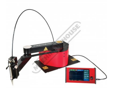
Setup With Trace Pen