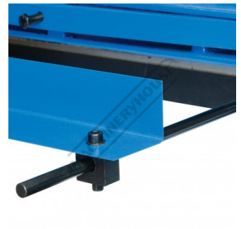
Adjustable Rear Stop