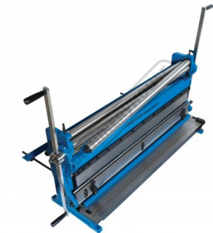
Swing Out Top Roller