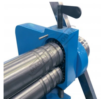
Wire Grooves Rolls