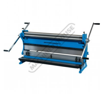
Curving Rolls Full View