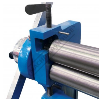
Solid End Housing & Top Roller Lock