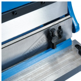
Material Clamp For Shearing