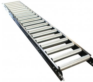
L818 Roller Conveyor