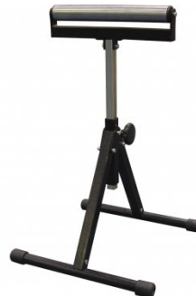
W343A Roller Stand