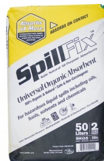
O000 SpillFix Universal Organic Absorbent