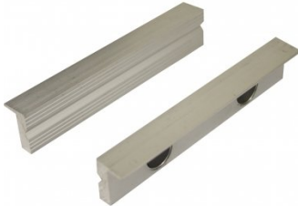
V0532 Aluminium Magnetic Soft Jaws