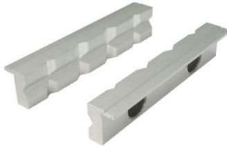
V0539 Aluminium Magnetic Soft Jaws