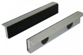
V0536 Aluminium Magnetic Soft Jaws