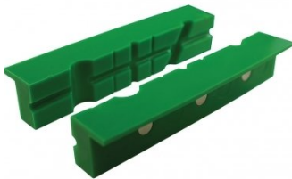
V0546 Plastic Magnetic Soft Jaws