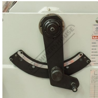
Rapid Blade Adjustment for Material Thickness