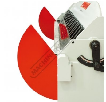
Apron Safety Guards