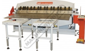
Shown with Optional Ball Transfer Tables - Order Code (L840)