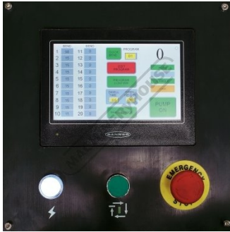
NC Ezytouch Control Panel