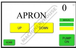
NC Ezytouch Manual Program