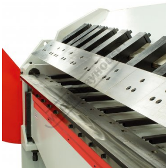
Shown with Material Clamp Beam Open