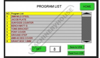
NC Ezytouch Program List