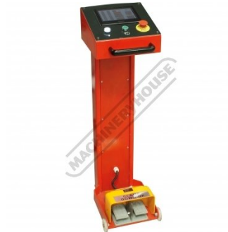
Roving Foot Pedal