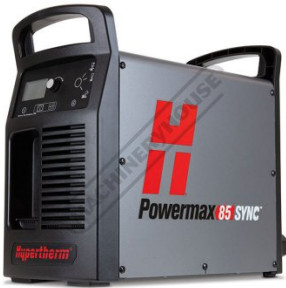
HYPERTHERM Powermax85 SYNC