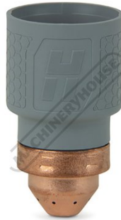
Mech Cartridge RFID Technology