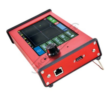
Import Via USB