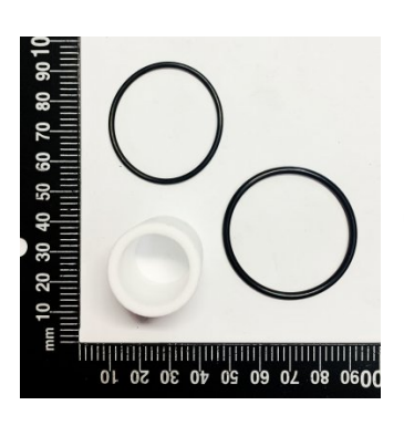
AP0022 Hypertherm Contact ring