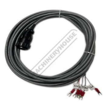
Universal CNC Cable