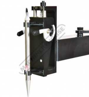
Trace Pen In Holder