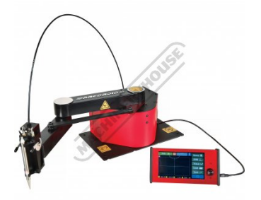
Setup With Trace Pen