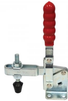
C0999 Vertical Toggle Clamp