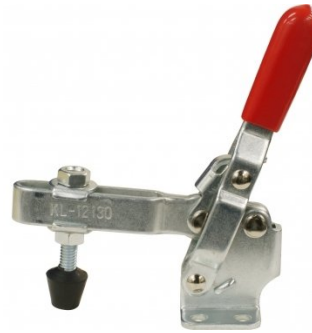
C100 Vertical Toggle Clamp