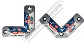
45, 90 & 135 Degree Magnets