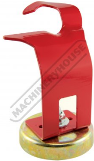
Magnetic Torch Holder