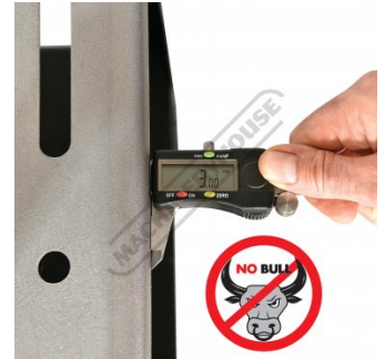
3mm Thick Bench Top