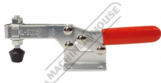
C1003 Horizontal Toggle Clamp