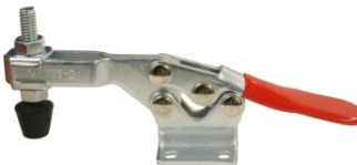
C1005 Horizontal Toggle Clamp