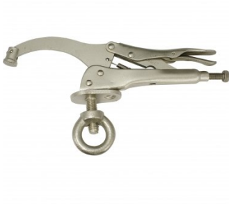
C103 9" Drill Press Locking Clamp