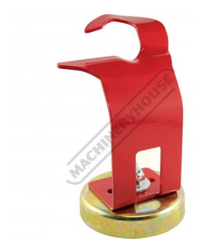
Magnetic Torch Holder