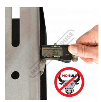
3mm Thick Bench Top