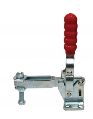
C1006 Horizontal Toggle Clamp