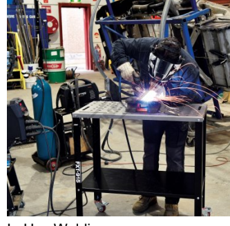
In Use Welding