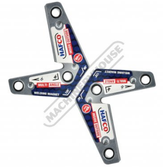
15, 60, 90 & 120 Degree Magnets