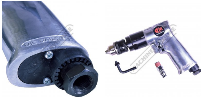
Quiet Handle Exhaust