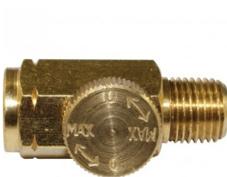
A219 Air Fittings