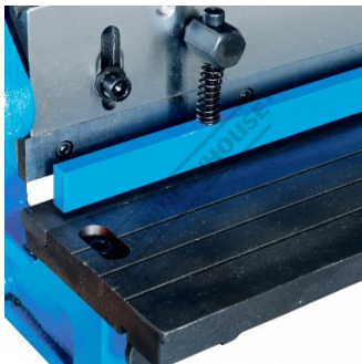
Material Clamp For Shearing