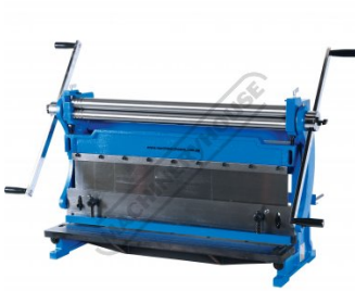
Curving Rolls Full View