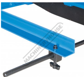
Adjustable Rear Stop