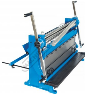
Swing Out Top Roller