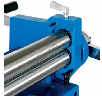
Geared Roll Drive