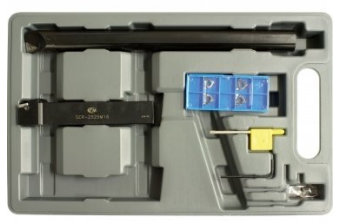
L459 Lathe Threading Tool Kit - Insert Type