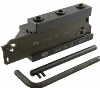
L465 Professional Lathe Parting Tool Kit - Insert Type