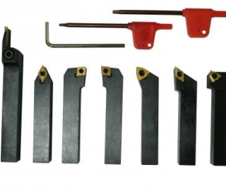
L0099 Lathe Turning Tool Kit - 7 piece Insert Type