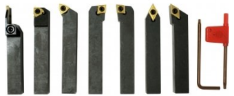
L0077 Lathe Turning Tool Kit - 7 piece Insert Type