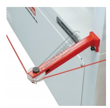
Safety Wire Interlock System