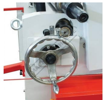
Motorised Up and Down Rear Curving Roller Right Side Hand Wheel For Material Thickness Adjustment