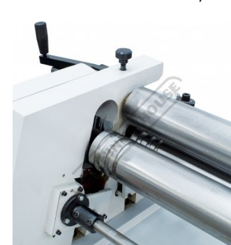
Wire Groove Rolls