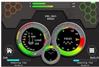
Hartrol Plus Main Screen