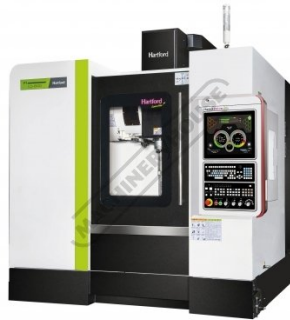
LG Hartrol Plus