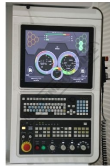
Hartrol Plus P2 Controller