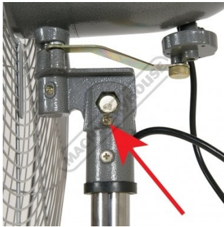
Head Tilt Locking Screw