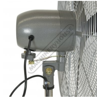
Motor Left View