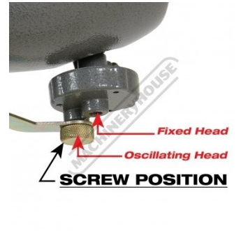
Fixed or Oscillating Screw Position