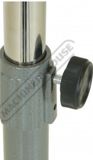
Height Adjustment Lock