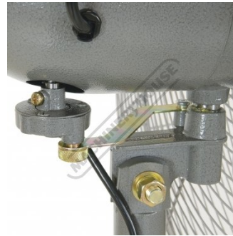
Oscillating Head Mechanism