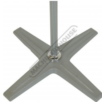
Cast Iron Base