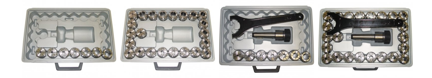
C963 Collet & Chuck Set - 25 Piece