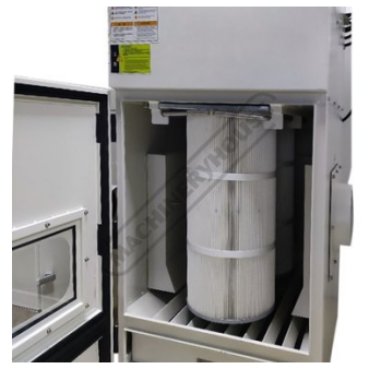
Quick Change Filter