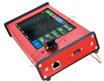
Import Via USB