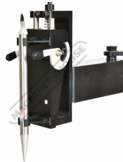
Trace Pen In Holder