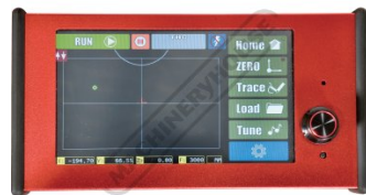
Touch Screen Interface