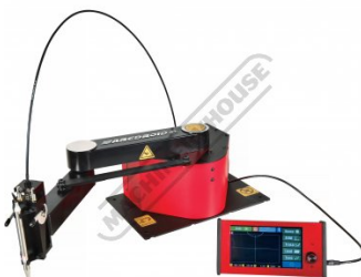
Setup With Trace Pen