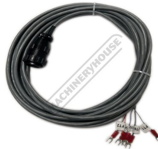
Universal CNC Cable