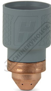
Mech Cartridge RFID Technology