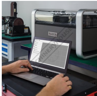
Web Base Software