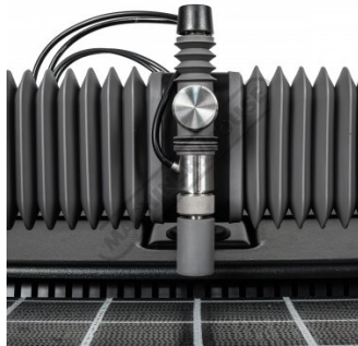
Cutting Head Inside Front View