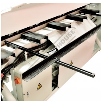
Adjustable Back Stop