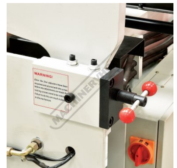
Clamp Beam Adjustment for Material Thickness