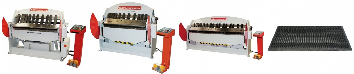
M805 Rubber Mat - Anti-Fatigue