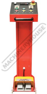
Roving Foot Pedal