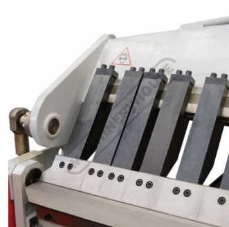
Extended Removable Fingers