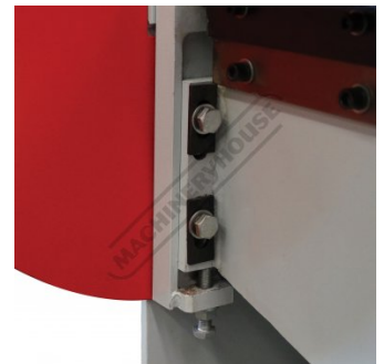
Adjustable Bending Beam