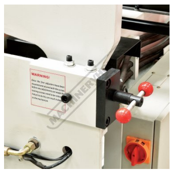
Clamp Beam Adjustment for Material Thickness