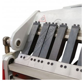
Extended Removable Fingers