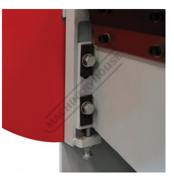
Adjustable Bending Beam