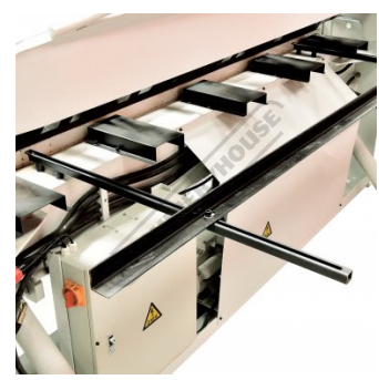
Adjustable Back Stop