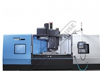
Mynx 9500 Front Open