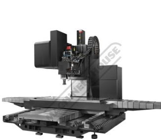
Mynx 9500 Frame