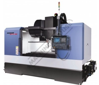
Mynx 7500 Side Open