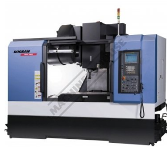
Mynx 5400 Side Open