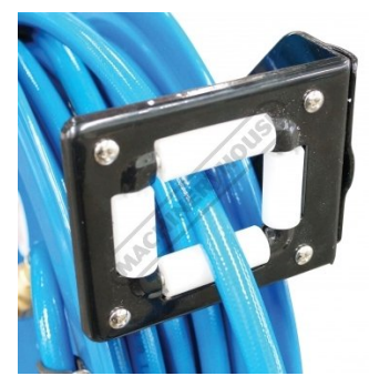
4 Way Roller Guide