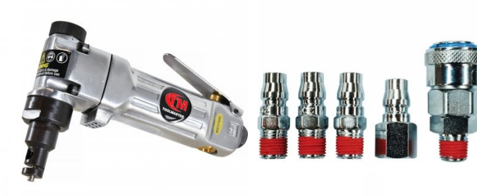
F951 High-Flow Air Fittings