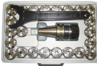
C967 Collet & Chuck Set - 25 Piece