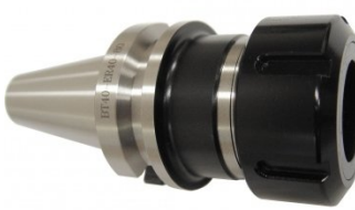
T226 BT40 x ER40-80 Collet Chuck