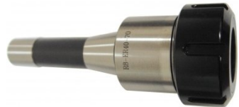
C138 Collet Chuck R8 x ER40