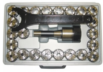
C964 Collet & Chuck Set - 25 Piece