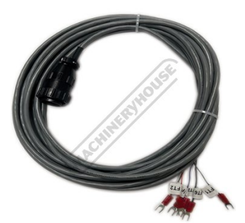
Universal CNC Cable