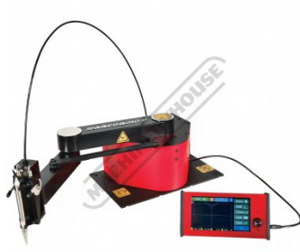
Setup With Trace Pen