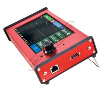
Import Via USB