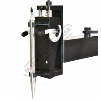
Trace Pen In Holder