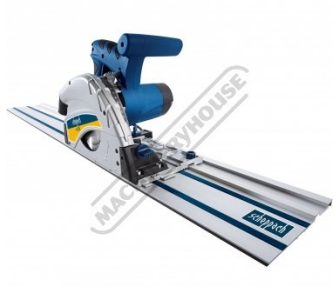
655 deal indexe the material subfratural indexe shipboard hypotod nen INF and double coaled baseds I I deeal for edging up to 15.5mm from the wall Saw in Up right Position - Shown with Optional Rail