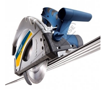
Bottom View - Shown with Optional Rail