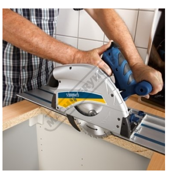
55mm maximum stepless cutting depth Mire cuts with stepless angle adjustment () to 45 Degree angle adjustment Perfect for kitchen worktops - Shown with Optional Rail