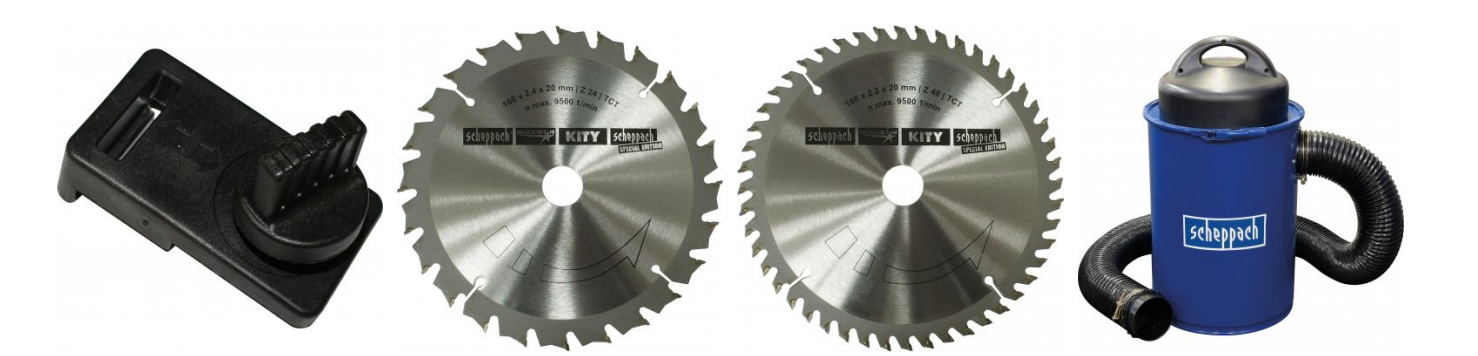
W885 Dust Collector