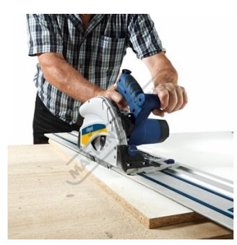
Achieve cuts usually performed on a panel sizing table saw - Shown with Optional Rail