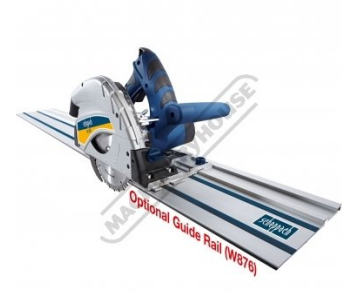
Shown with Optional Guide Rail