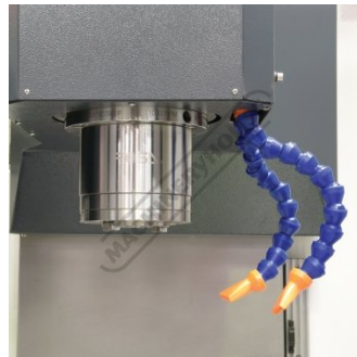
Quill With Coolant Hoses