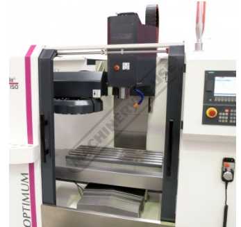
Front Close Up