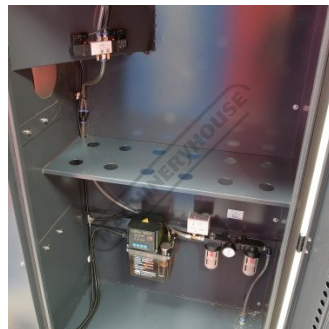
Rear Storage Holder