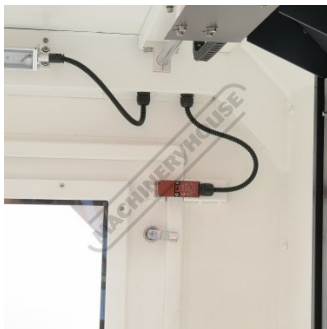
Micros on Doors