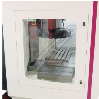
Left Access Door