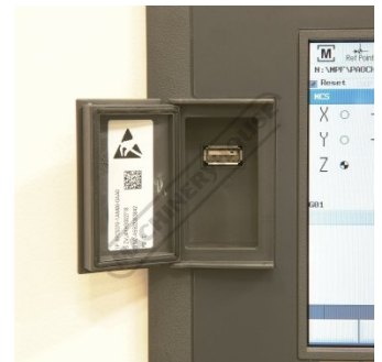
USB Input on Control Panel