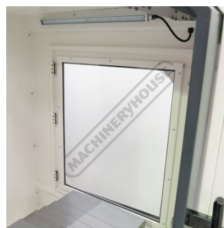
Right Access Door Inside View