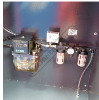
Auto Lubrication and Air Filter