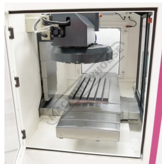
Left Access Door View Inside