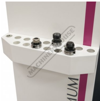
BT Tool Storage