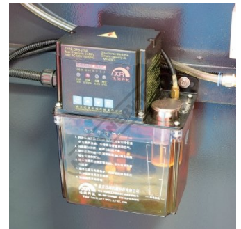
Auto Lubrication System