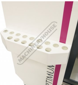
BT Tool Storage Holder