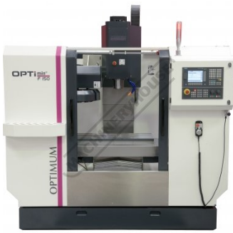
Front View Doors Open