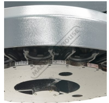
Tool Changer Close Up