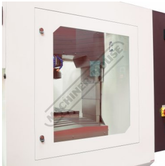
Right Access Door