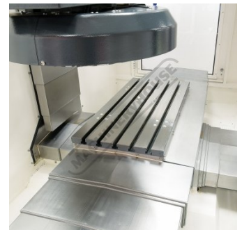
Work Table Left View