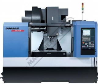
DNC 750 II Side Open