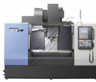
DNC 6700 Front Open