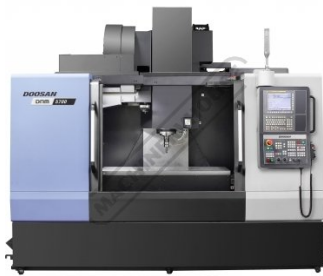
DNC 5700 Front Open