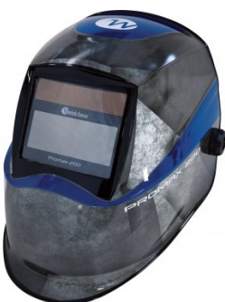
W001 Auto Darken Welding Helmet - 9-13 Shade