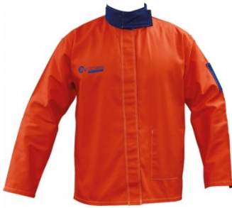
W1000A Promax HV5 Welding Jacket