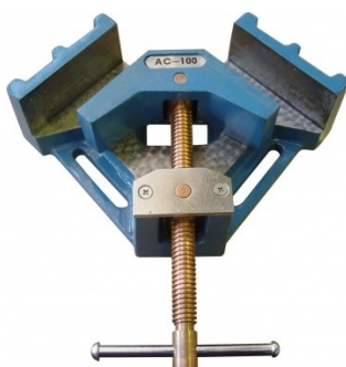
V100 90 degree Angle Vice Clamp