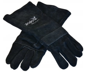
W100 ROGUE™ Heavy Duty Welding Gloves - 400mm