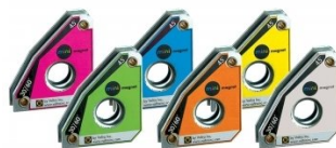
W1008 Mini Magnet Squares - (6-Pack)