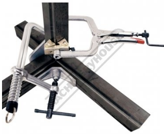
Shown With Optional Pipe Plier