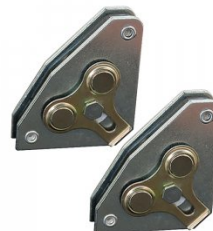
W1011 XYZ Magnet Squares - Multi-Angle - (2-Pack)