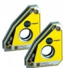
W1009 Mini Magnet Squares - (2-Pack)