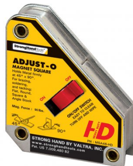
W1007 Adjust-O Magnet Square - Heavy Duty