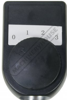
3 Fan Speeds