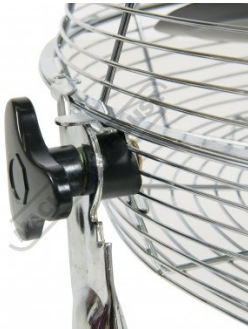
Tilt Head Locking Knob