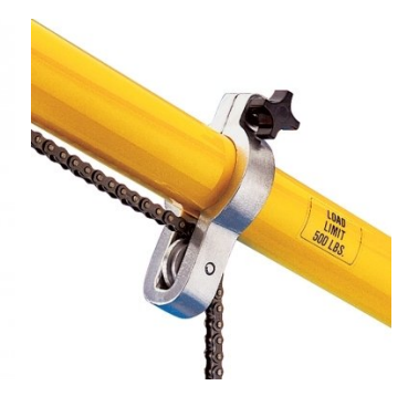
A358C Bolt Down Adaptor