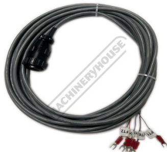
Universal CNC Cable