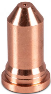
C591 1.1mm Cutting Tips