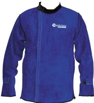
W1002A Professional Promax BL7 Welding Jacket