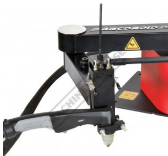
Plasma Torch Cradle