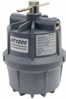
C492 Plasma Sub-Micronic Air Filter Canister