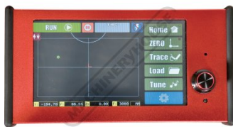
Touch Screen Interface