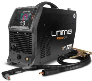
Razorcut 120 Complete Package