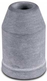
C595 Retaining Cup Heavy Duty