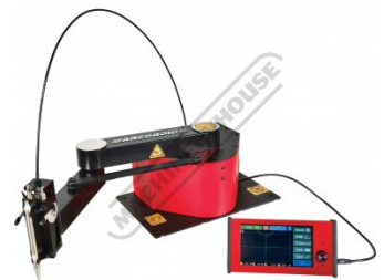
Setup With Trace Pen