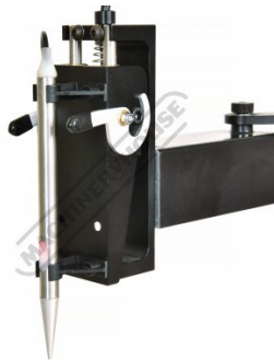
Trace Pen In Holder