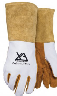
W101 TIG Welding Gloves - 310mm