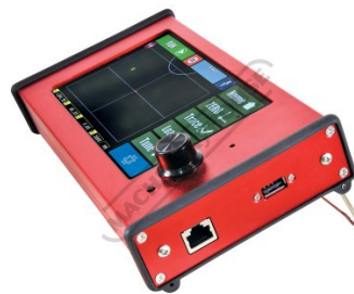
Import Via USB