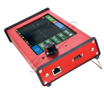
Import Via USB