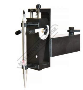
Trace Pen In Holder