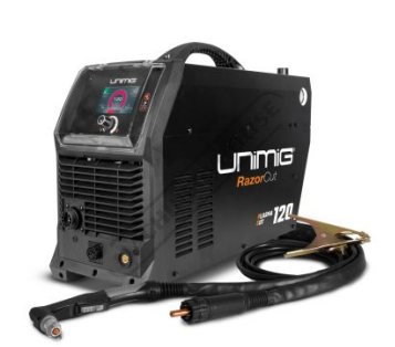
Razorcut 120 Complete Package