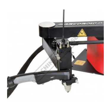
Plasma Torch Cradle