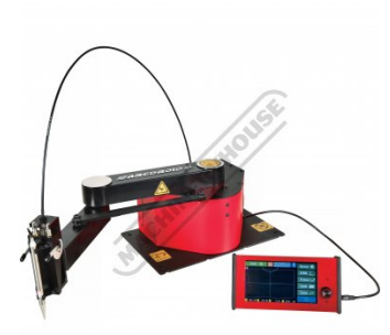
Setup With Trace Pen