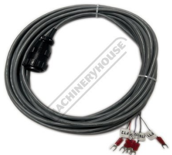
Universal CNC Cable