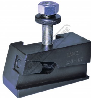
Shown as in Box