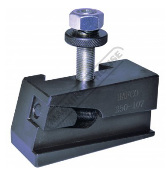
Shown as in Box