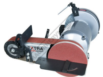
Shown On G1590 Platen Table Rear View