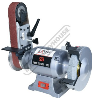
Shown On G1590 Shown on Vertical Set Up