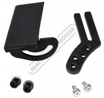
Includes Table, Bracket & Mounting Screws