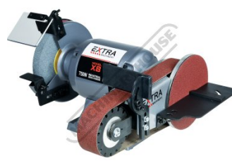
Shown On G1590 Flaten Table