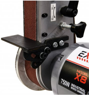
Shown Set Up at 90 Degrees, On Optional Grinder/Linisher