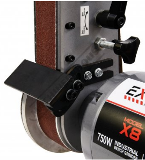
Shown Set Up at 45 Degrees, On Optional Grinder/Linisher