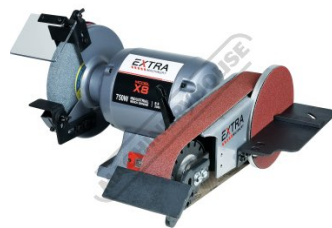
Shown On G1590 Tilted