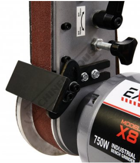
Shown Set Up at 60 Degrees, On Optional Grinder/Linisher