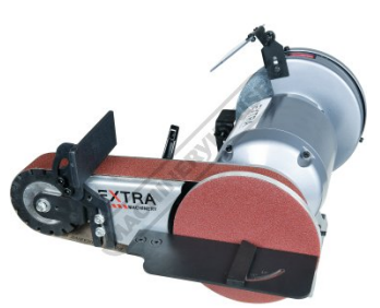
Shown On G1590 Platen Table Rear View