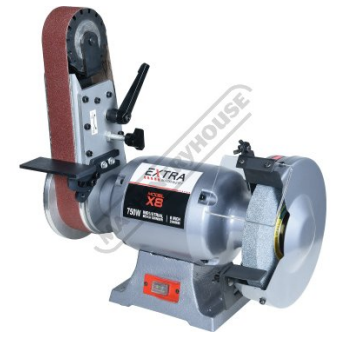
Shown On G1590 Shown on Vertical Set Up Shown On G1590 Tilted