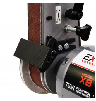
Shown Set Up at 90 Degrees, On Optional Grinder/Linisher Shown Set Up at 45 Degrees, On Optional Grinder/Linisher Shown Set Up at 60 Degrees, On Optional Grinder/Linisher Includes Table, Bracket & Mounting Screws