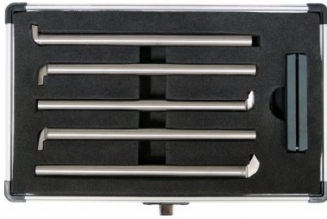
L006A Boring Bar Set - HSS