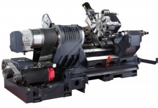
Puma 4100 Chassis