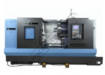
Puma 4100 Front View