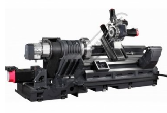
Puma 5100 Chassis