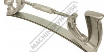
Shown with Optional File Top View Angle