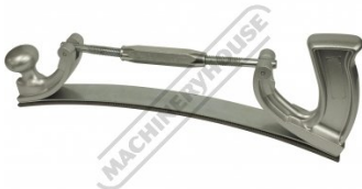
Shown with Optional File Top View