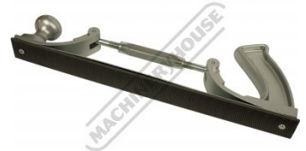
Shown with Optional File Bottom View