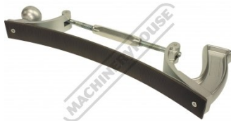
Shown with Optional File Bottom View Angle