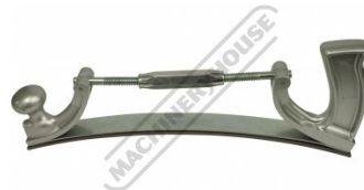
Shown with Optional File Front View Angle