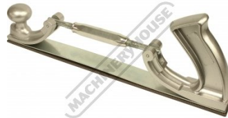
Shown With Optional File