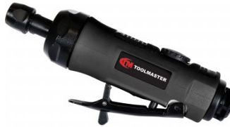
A040 Air Die Grinder