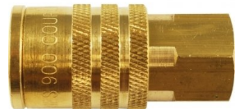
F900 Air Fittings