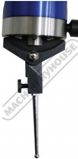
Stylus Shown Attached