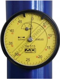
Jeweled Metric Dial