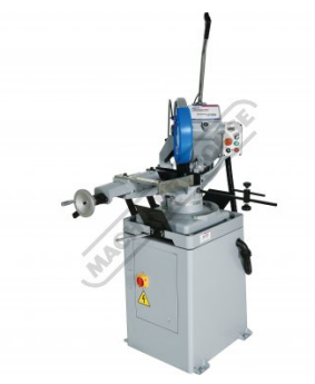
Dual Mitre Head