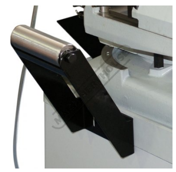
Material Roller Support