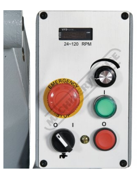
Digital Readout Control Panel