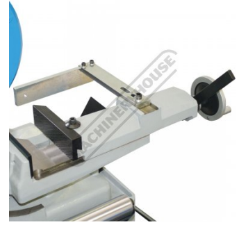
Quick Action Vice