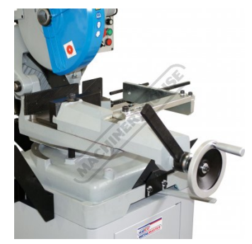
Quick Lock Vice