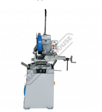
90 Degree Cutting