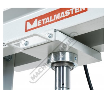
Sliding Ram With Handle