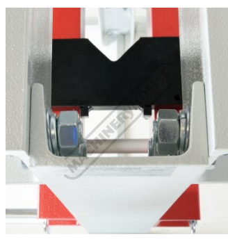
Solid Channel Frame