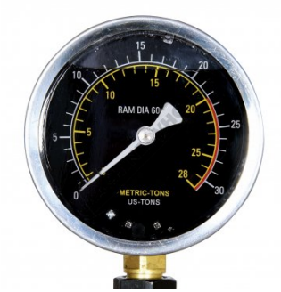
Metric / Imperial Pressure Gauge