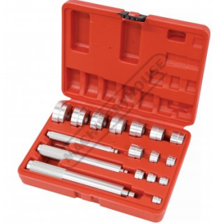
PDS-2B - Bush Driver Set - 17 piece Solid Side Channel Frame