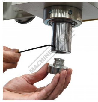
Includes Removable Ram Top Cap Horizontal Sliding Ram