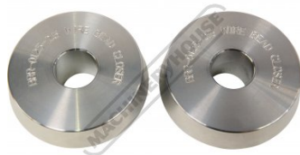
Wire Bead Closers Top View