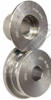
Wire Bead Male and Female Rolls