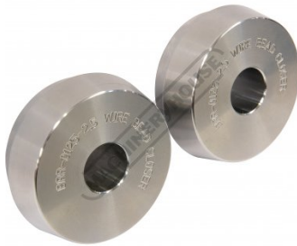
Wire Bead Closers