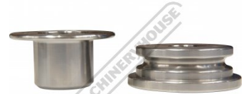
Wire Bead Male and Female Roll Profile View