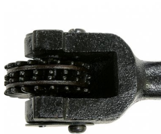
Head Bottom View