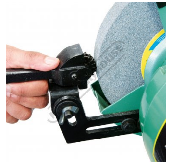
Setup for Dressing a Grinding Wheel Close Up