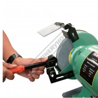
Setup for Dressing a Grinding Wheel