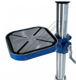
Table Rack Pinion Wind Up