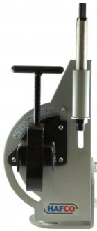
P090 Pipe & Tube Notcher Attachment