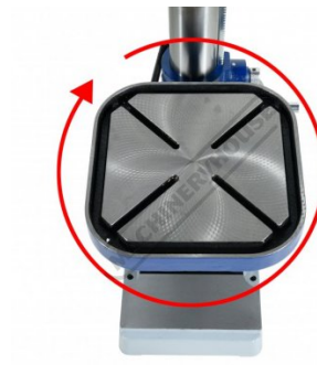
Cast Iron Table Rotates 360 Degree