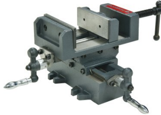
V1204 Compound Drill Vice