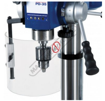
Drill Chuck Safety Guard With Micro Switch