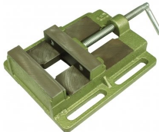
V125 Drill Press Vice