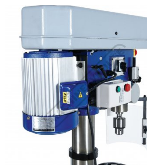
415V 1HP Motor