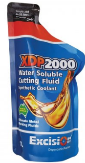
S090A Soluble Metal Cutting Fluid - 1 Litre