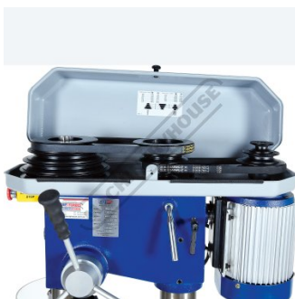
B Section Belt Drive System