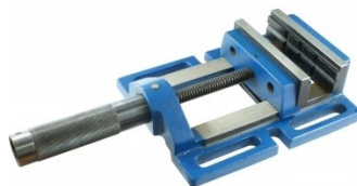
V145 Drill Press Vice