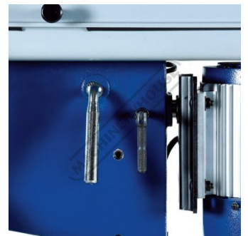
Belt Tension & Lock Lever