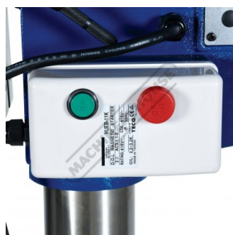
ON / OFF Power Switch