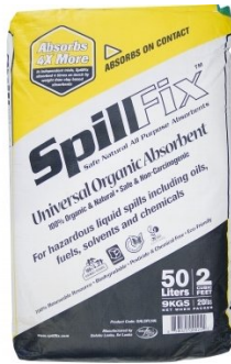
O000 SpillFix Universal Organic Absorbent