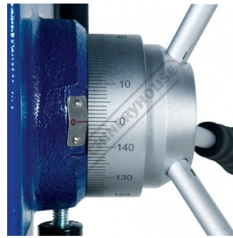
Drilling Depth Stop Setting With Scale