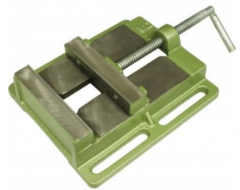
V126 Drill Press Vice