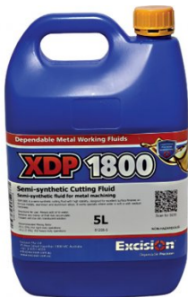
S090 Soluble Metal Cutting Fluid - 5 Litre