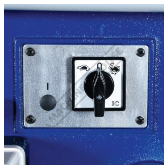
2 Speed Switch