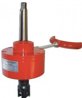
T003 Reversible Tapping Chuck