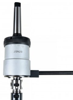
T005 Reversible Tapping Chuck - Adjustable Clutch