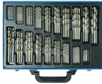
D1171 Metric Industrial HSS Reduced Shank Drill Set