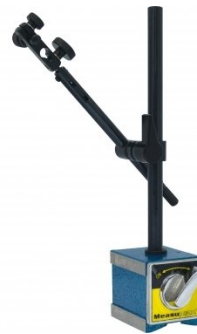
Q435 Magnetic Base - Large