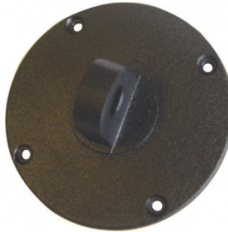
Q2125 Back Plate with Lug for Dial Indicators