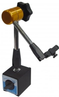
M051 Magnetic Base - Deluxe - One Lock