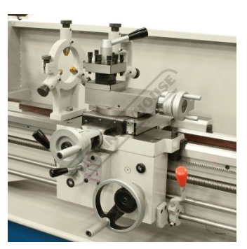
Saddle Right View