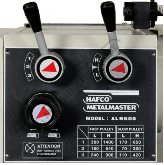
Head Stock Controls