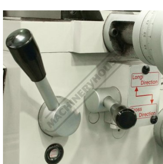
Feed and Threading Engagment Levers