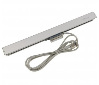
D5249 Scale - Backing Plate & Cover

D5204 Sino Digital Readout Lathe Mounting Bracket Kit