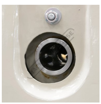
40mm Spindle Bore