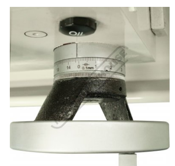
Saddle Hand Wheel Graduations