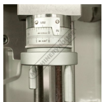
Compound Slide Dial Graduations