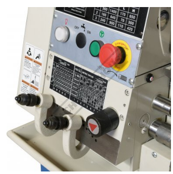
Feed Threading Levers and Control Panel Feed and Theading Levers