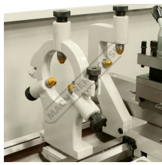
Fixed & Travelling Steadies