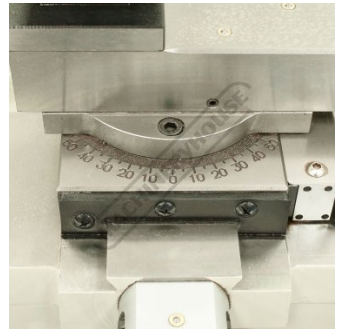
Compound Slide Angle Scale