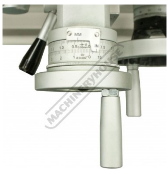
Cross Feed Dial Graduations