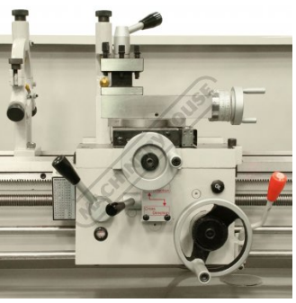
Saddle Front View