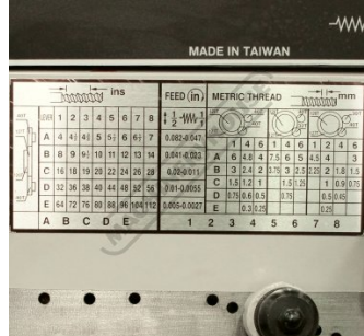
Feed and Theading Charts