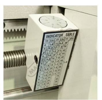
Thread Chasing Dial