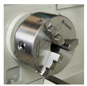
3 Jaw Chuck

sales@machineryhouse.com.au www.machineryhouse.com.au