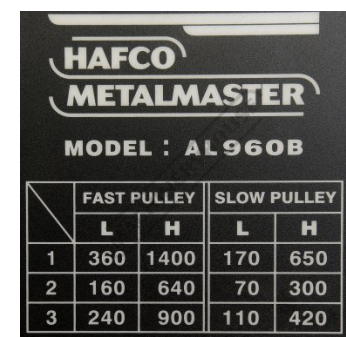
Spindle Speed Chart