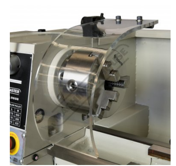
Safety Chuck Guard