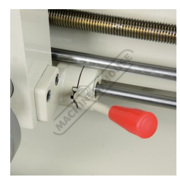
Spindle Engagement Lever